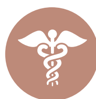
Health Care & Social Assistance