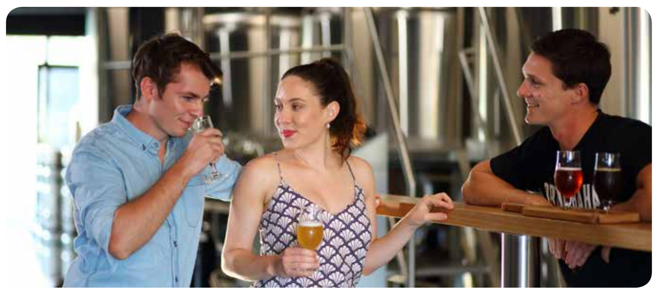
Brouhaha Brewery, Maleny.

This plan details the actions that Sunshine Coast tourism industry representatives identified as the priorities for the development of the region's future workforce.