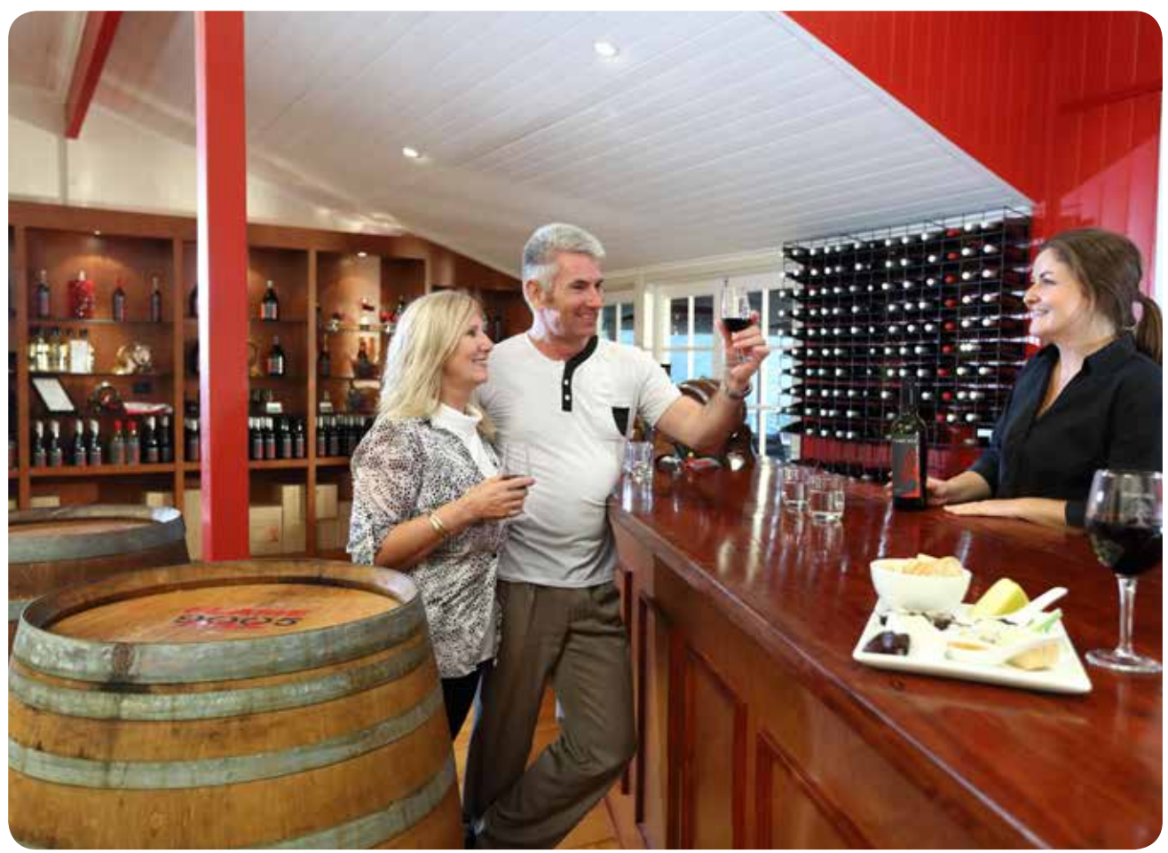
Flame Hill Vineyard, Montville.