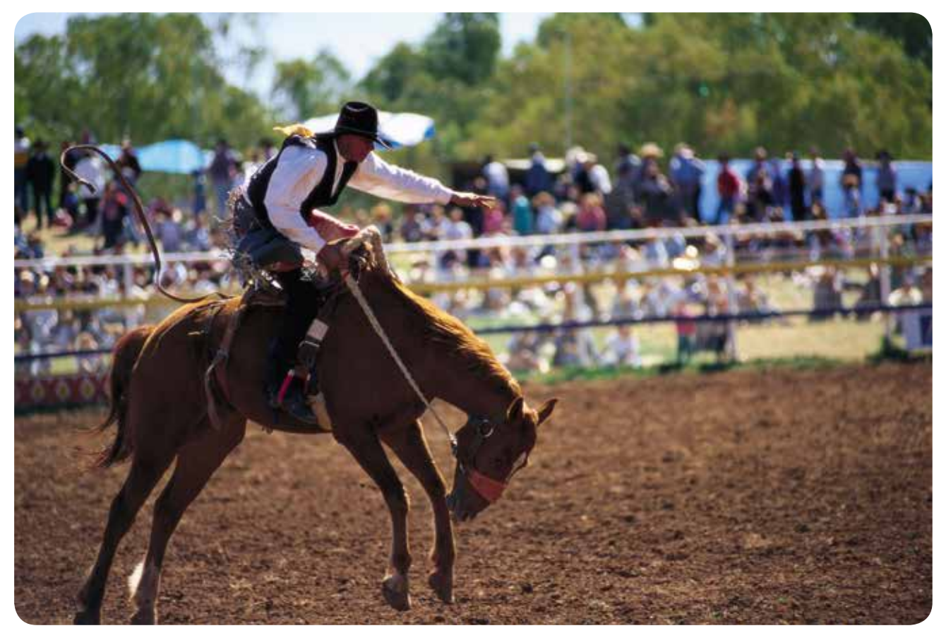
Mount Isa Rodeo.

6. Explore options to develop a pilot tourism industry portal.