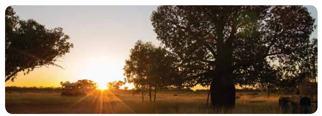
Bonus Downs Farmstay, Mitchell.

This plan details the actions that Outback Queensland tourism industry representatives identified as the priorities for the development for the region's future workforce. The North West, Central West and South West Outback areas identified different actions to address these priorities, reflecting the different needs of the communities in this vast tourism region.