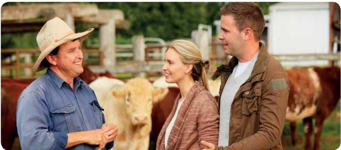
Bethany Cottages.

This plan details the actions that Southern Queensland Country Regional tourism industry representatives identified as the priorities of the development for the region's future workforce.