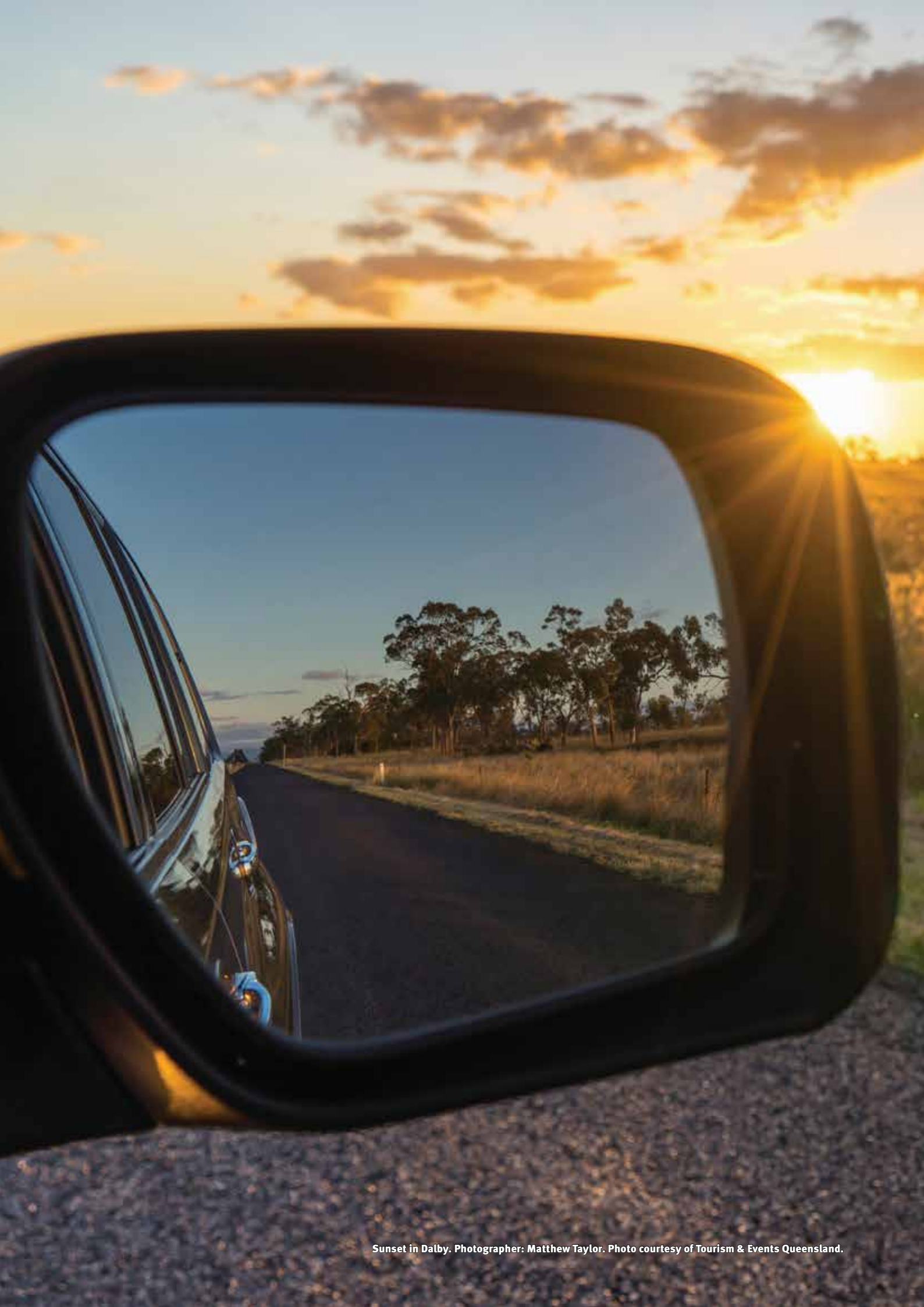
Sunset in Dalby.