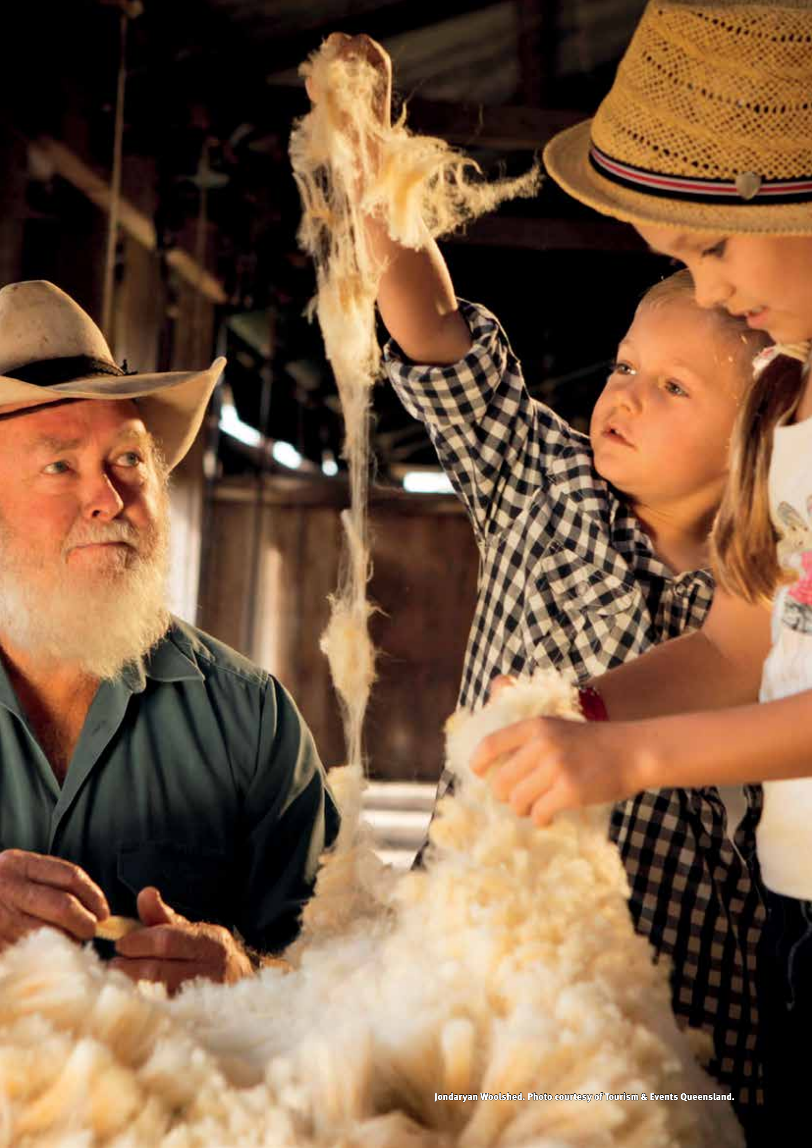
Jondaryan Woolshed.