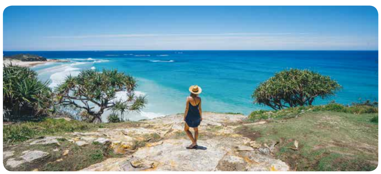
North Stradbroke Island.

3. Develop industry-endorsed resources that demonstrate to students and parents the value of careers in tourism and define the competencies and skills gained.